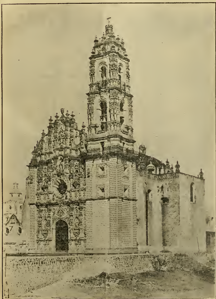
Cathedral in Tepozotlan, Mexico.