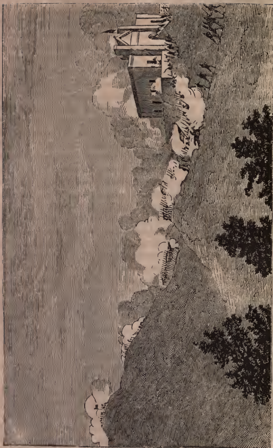
Taking of the Bishop's Palace.—p. 185.