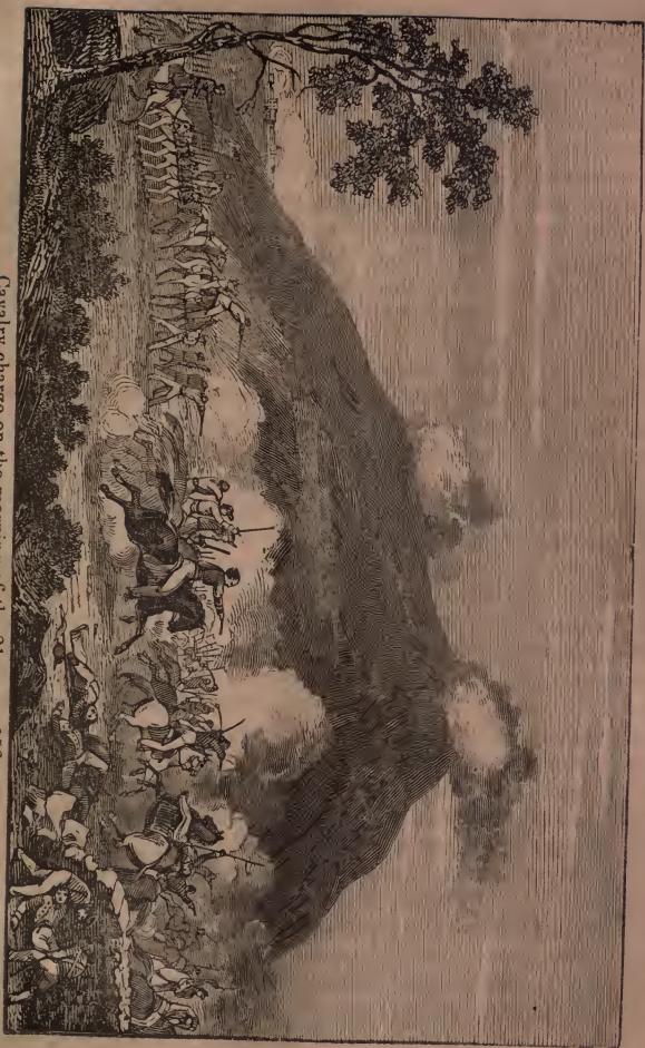
Cavalry charge on the morning of the 21st.—p. 156.