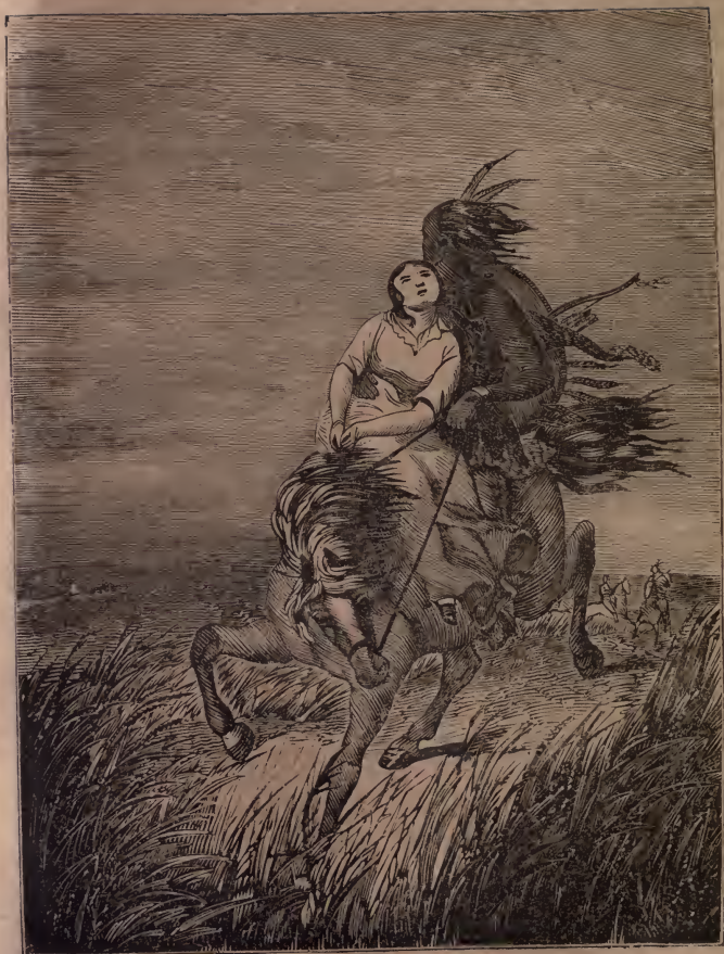
The Abduction.—p. 87.