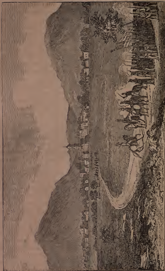
View of Marin. Advance of the American army.—p. 133.