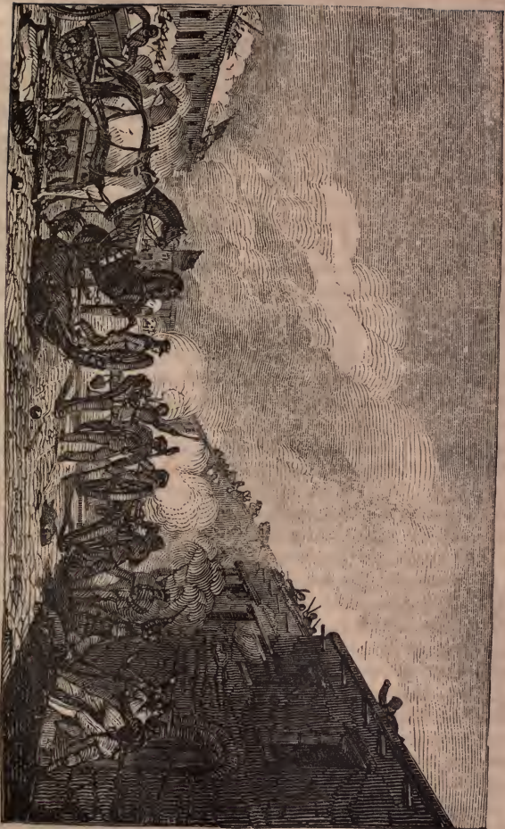
Street Fight, on General Worth's side.—p. 192.