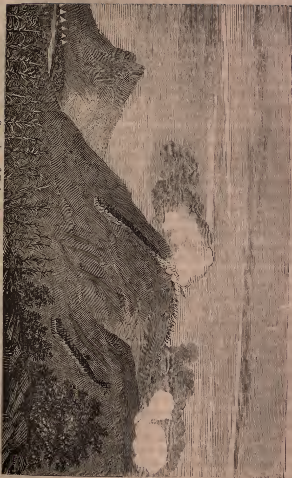
Storming of Federation Hill and Fort Soldada.—p. 162.