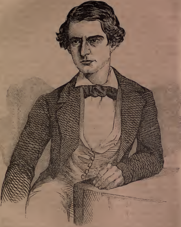
Colonel Jack Hayes, from a Daguerreotype by Noeselle, New Orleans.—p. 108.