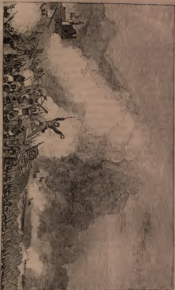
Storming of Fort Teneria, by the Mississippians and Tennesseans.—p. 176.